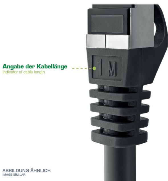
Angabe der Kabellänge Indicator of cable length